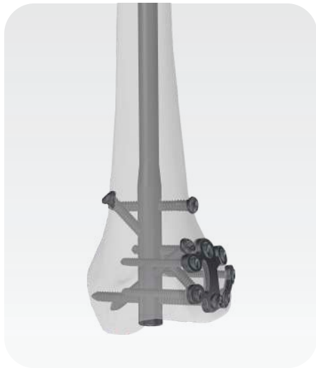
ASLP - 3.5/5.0 Distal Lateral Condylar Plate