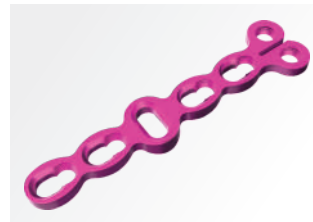
ASLP - 2.0 Rotation Correction Plate