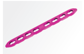
ASLP - 2.0 Straight Plate