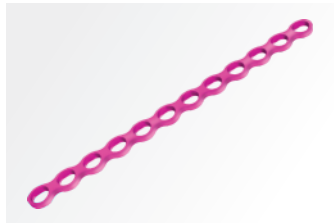
2.0 Adaption Plate

Length 6 to 14 mm (1 mm Increment) Length 16 to 30 mm (2 mm Increment)