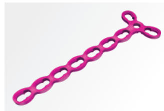
ASLP - 2.0 Y - Adaption Plate