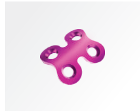
2.0 Mini H-Plate