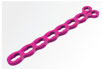
ASLP - 2.0 Condylar plate